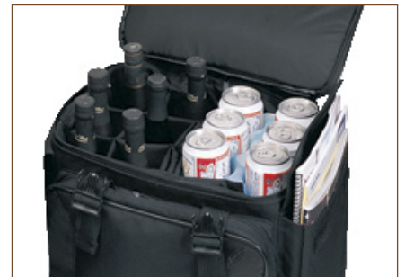
Featuring the 6 detachable sections to accommodate bottles of various sizes.