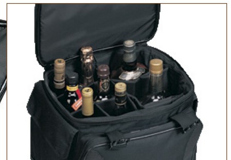
Featuring the 6 detachable sections to be used as a regular cooler.